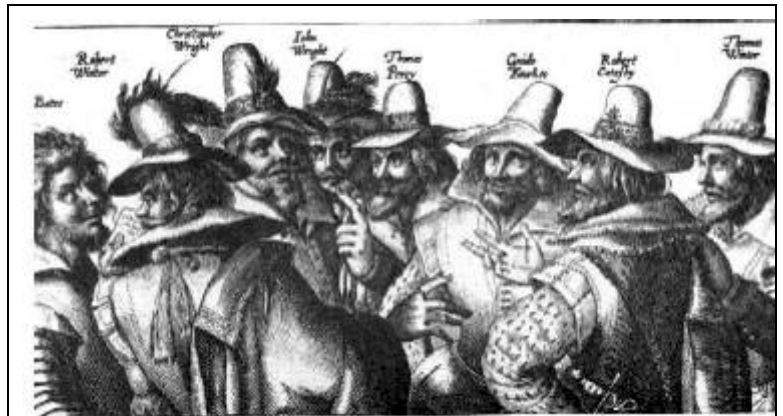
Phony enemies then: Guy Fawkes and Dupes of 1605

Initiated in the State of California, October 25th, 2005.